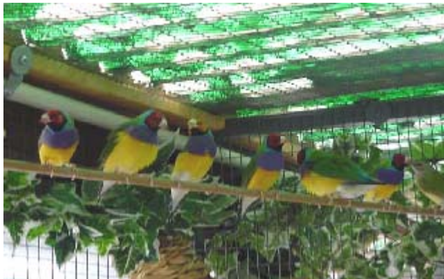
Some my Male babies 2001