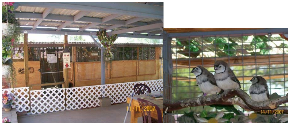
My Owl New Babies born 2007

Updates Con't This year 2007 my husband is almost finished with closing the aviary for the winter months and has done a great job with the bottom half of the aviary is now wood and the top half has windows that I can open And drop down during summer an close in winter.