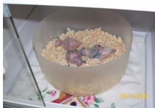
3 little guys.